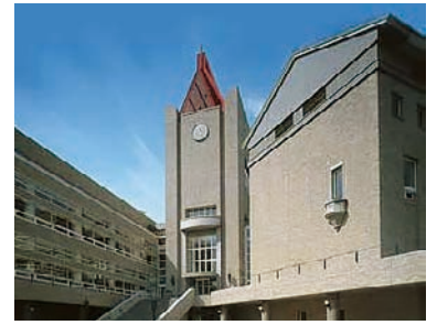
Central Library (Waseda Campus Bldg. 18)

Waseda University Library is one of the most extensive private university libraries in Japan and holds over 5.8 million volumes. The library has a long history started in 1882 when the university was originally founded as Tokyo Senmon Gakko.