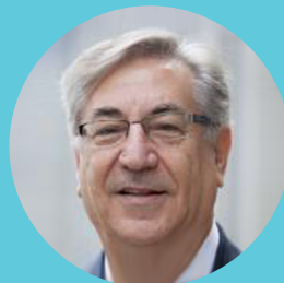
Mr. Karmenu Vella European Commissioner for Maritime Affairs and Fisheries (Video message)