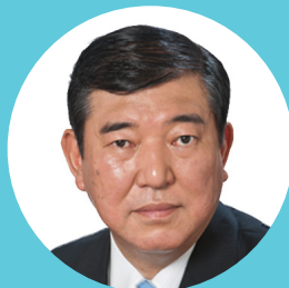
Mr. Shigeru Ishiba Member of the House of Representatives; Chair, Liberal Democratic Party's Fisheries Basic Policy Committee