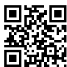
WASEDA University Nishiwaseda Campus Map