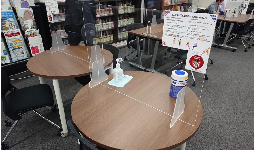
By preventing the spread of infection, students can interact in ICC lounge.