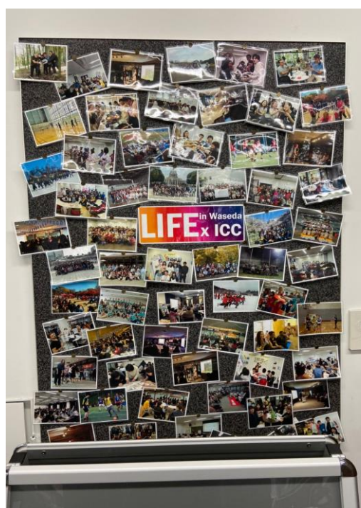
Bulletin board in ICC