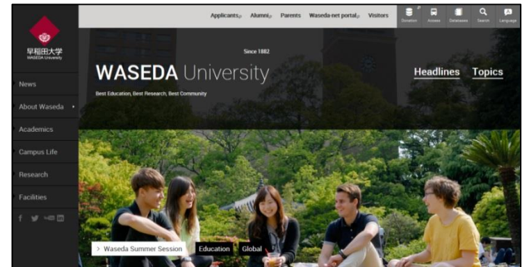
2. Waseda Top Page