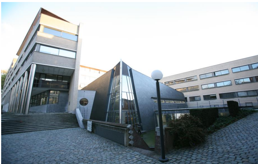
Faculty of Economics and Business - Leuven Campus