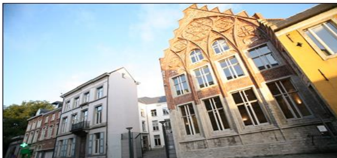
Faculty of Economics and Business Campus Leuven - Restored historical facade

Studio: private kitchen and bathroom, furnished. Average price: between €480 to €600 per month.