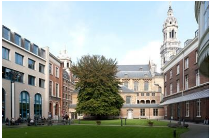
Faculty of Economics and Business - Antwerp Campus