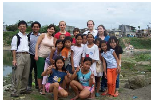
Site visit guided by IDENTTE community members on Sunday February 15 th 2009.

I learned that the Philippines is “the text capital of the world” so it could be a good idea to include this country as my case study in my MA thesis. Filipinos experienced “People Power” I in 1986 and a second one in 2001 that led to the overthrow of the National Presidents and the use of SMS had a large impact on the process.