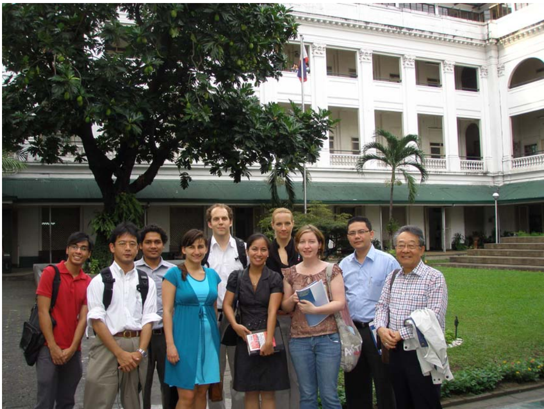
Professors and Students at De La Salle University. Manila, February 20 th 2009.