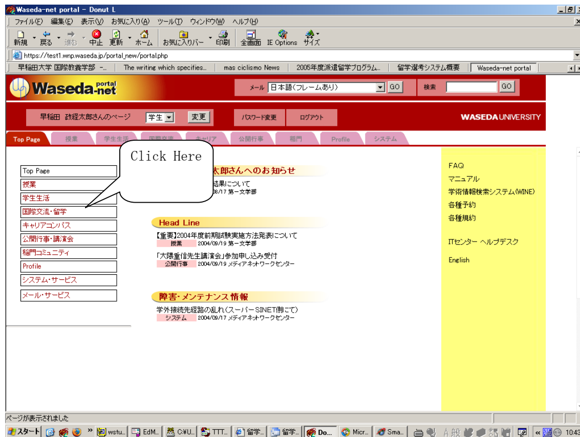
Waseda-net Portal Front Page

Students must submit all application documents between October 26 and October 28, in order to complete the web application registration process,