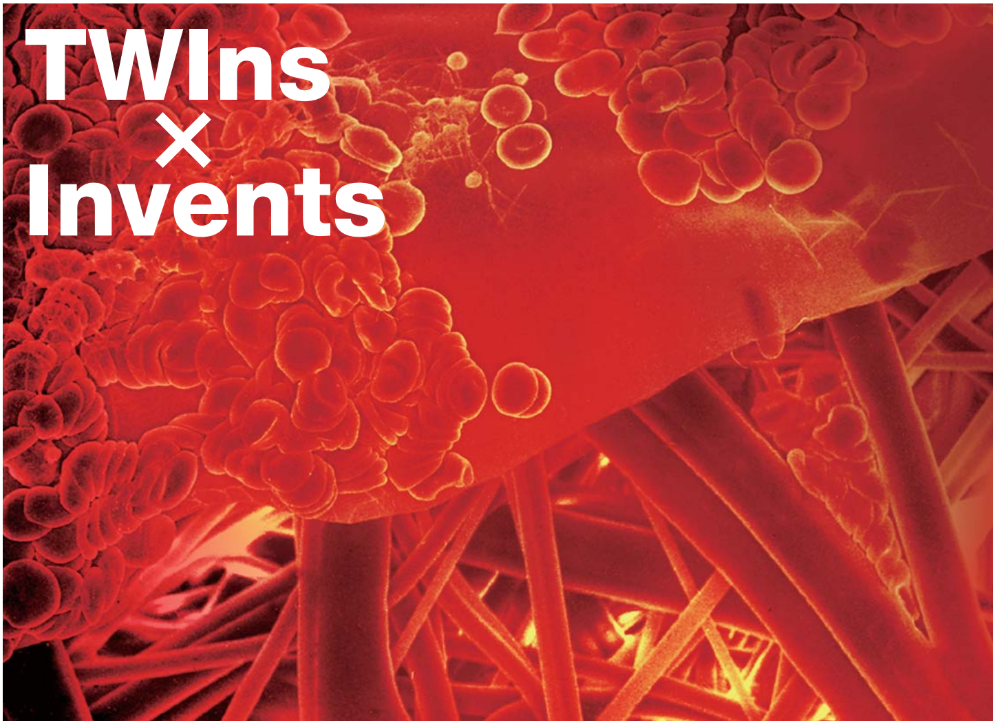
SEM image of blood cells deposited on the surface of polysaccharide nanosheet overlapping the Polypropylene fibrous mesh (colord)