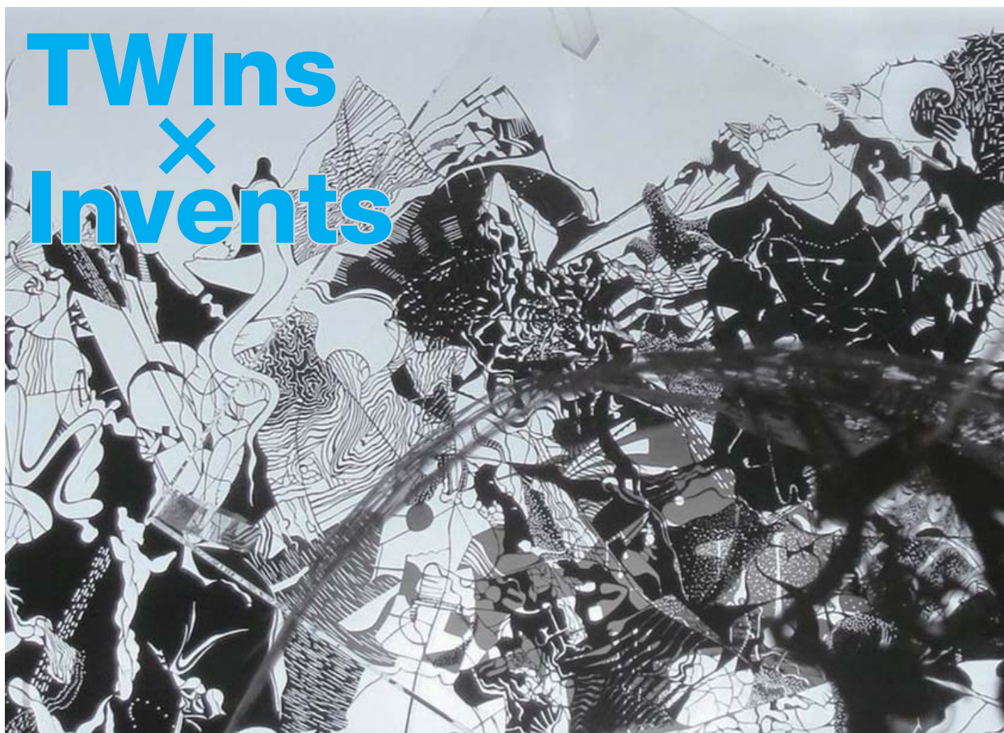
Mobile Composition IV ©Hideo Iwasaki